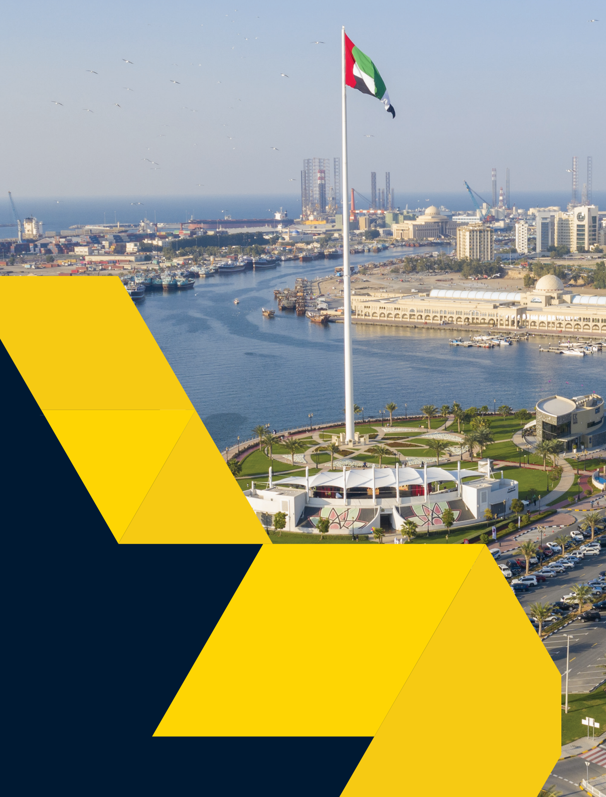
Table of Content