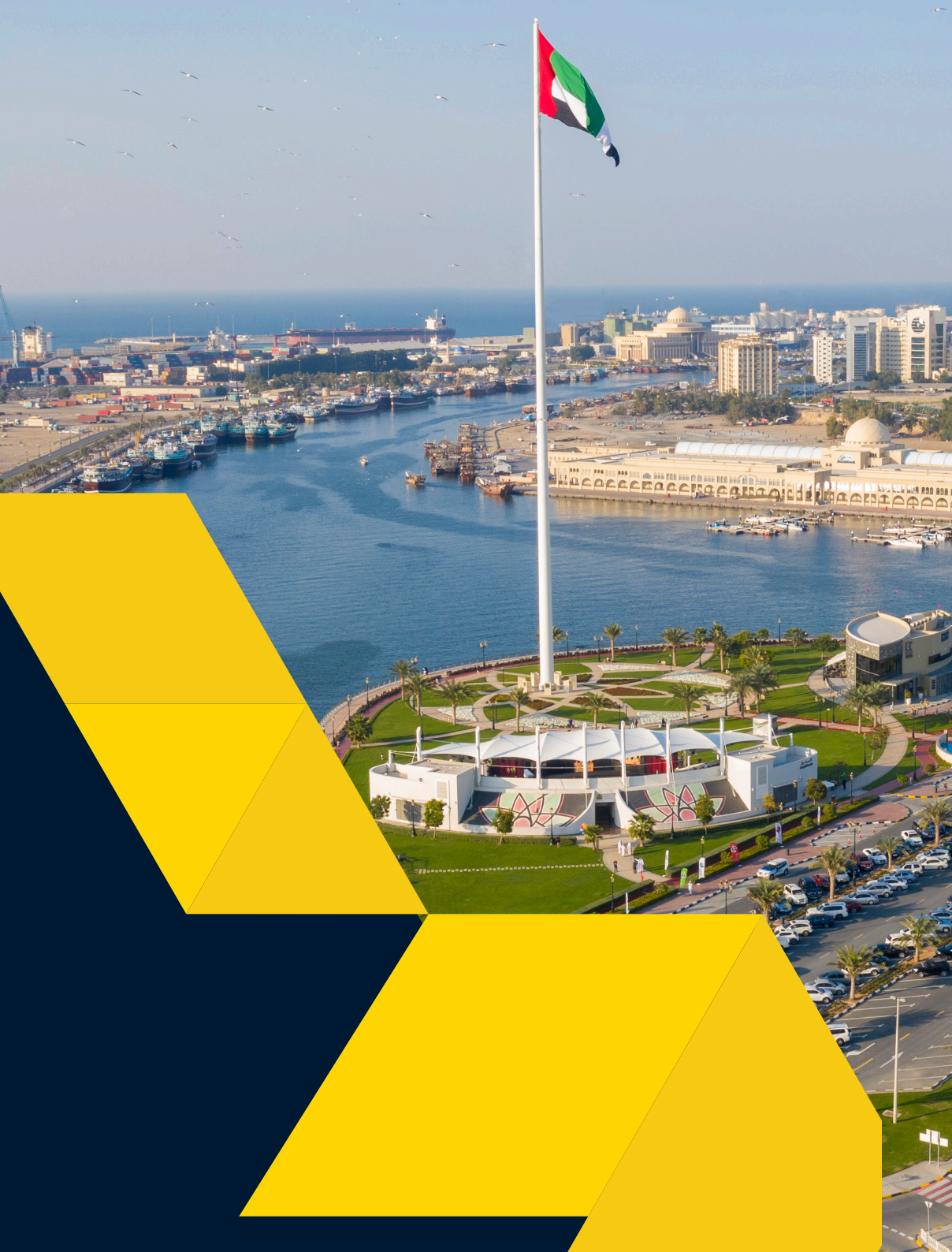
Table of Content